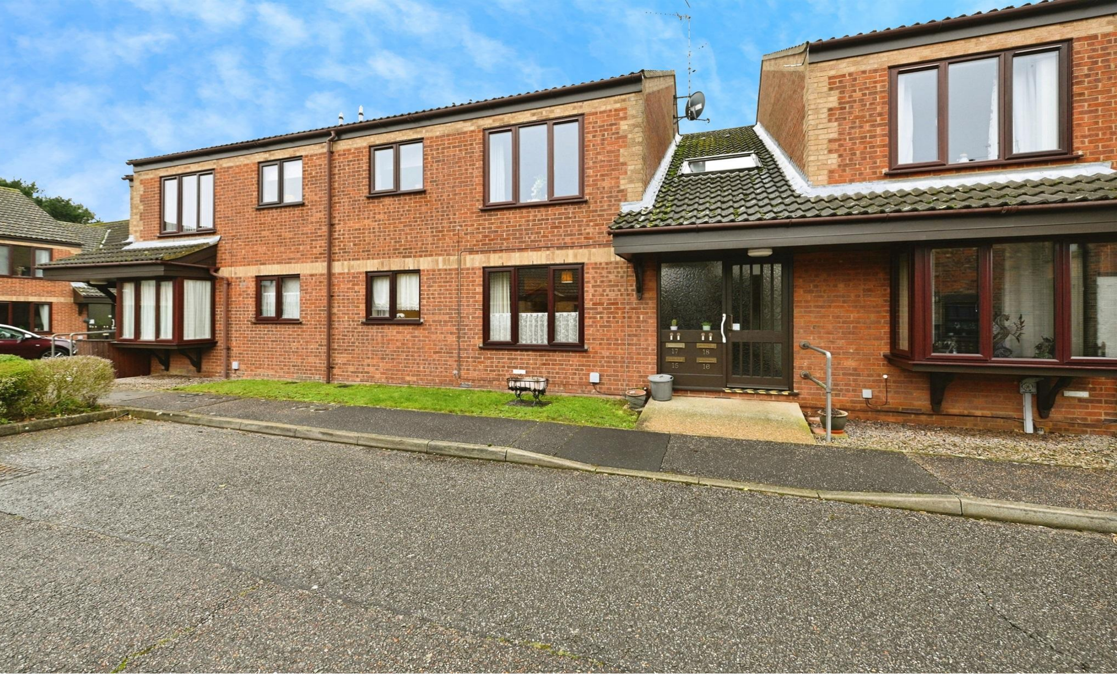
Lavender Court, Gaywood, King's Lynn, PE30 4HL