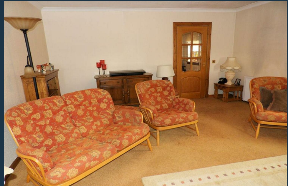
A beautifully fitted kitchen and a bright spacious lounge with superb rural views