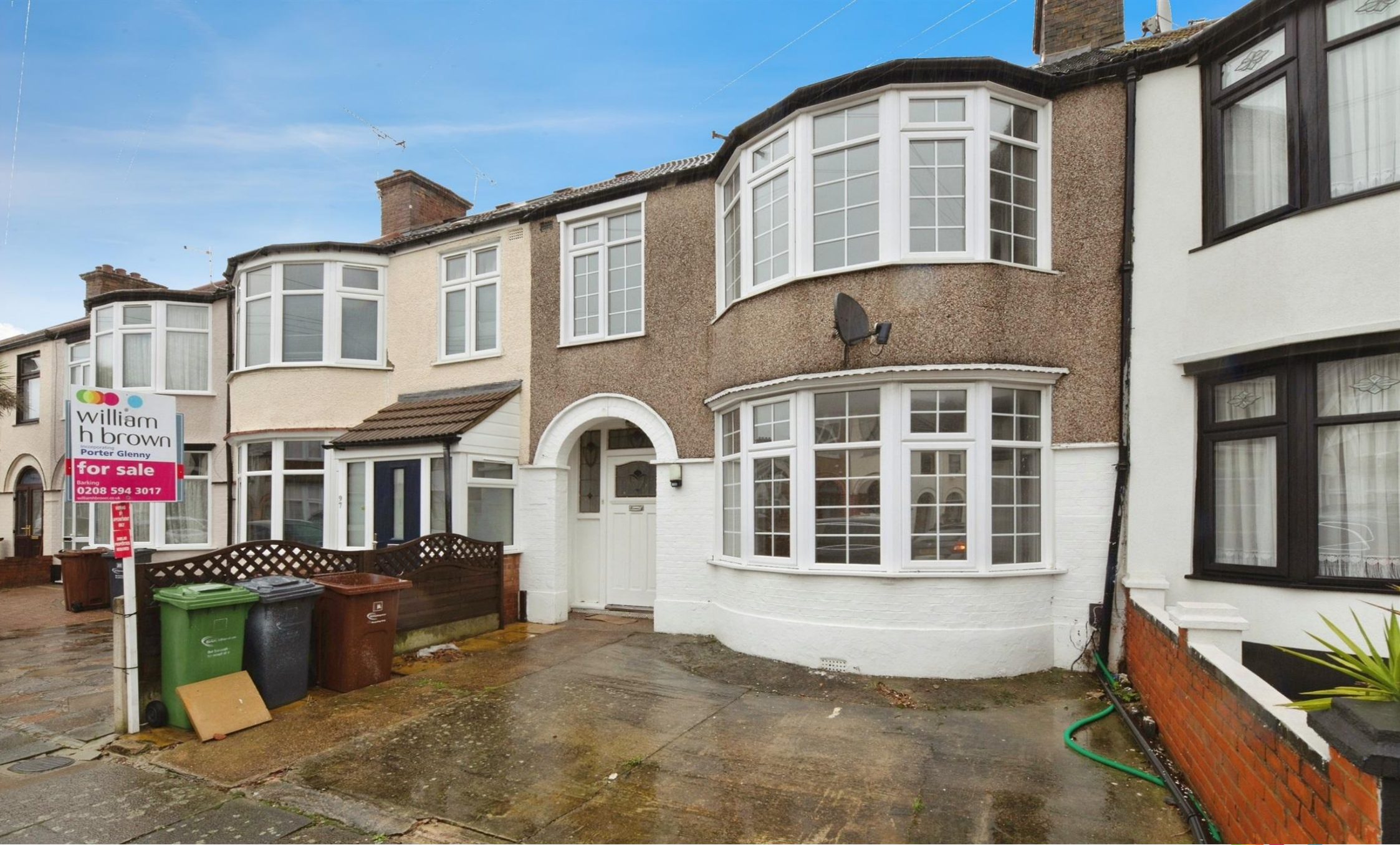
Shirley Gardens, Barking, IG11 9XB