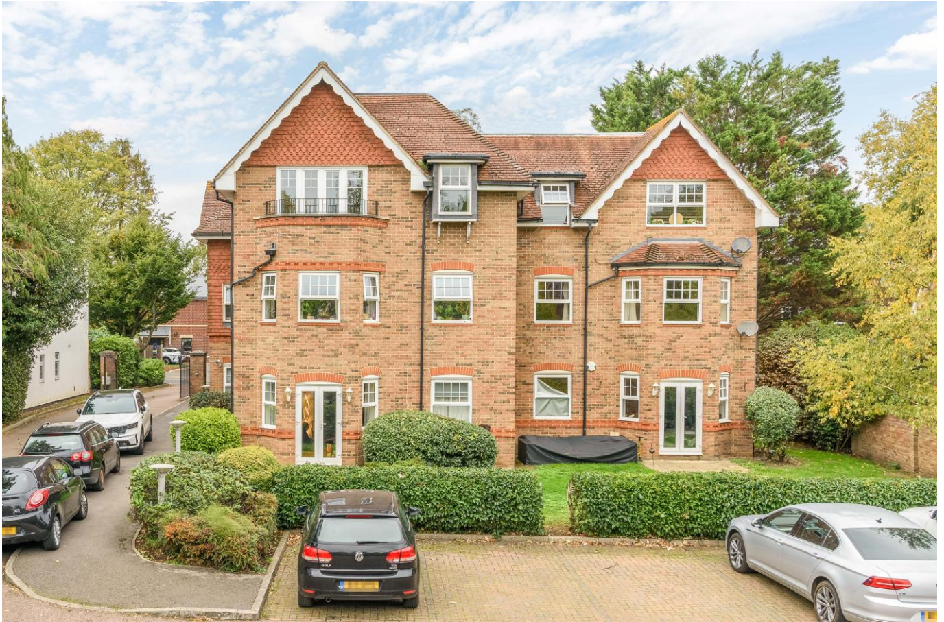
1 Ashley Place Ashley Road Walton-On-Thames Surrey KT12 1JF