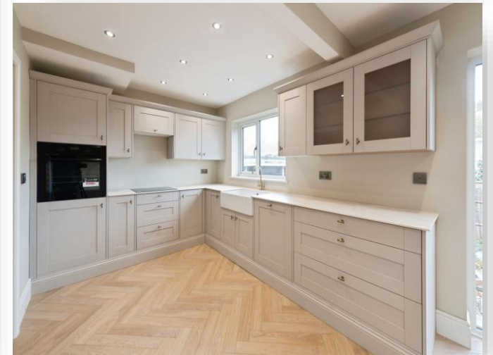
Orchard Grove, Waterlooville PO8 8TP