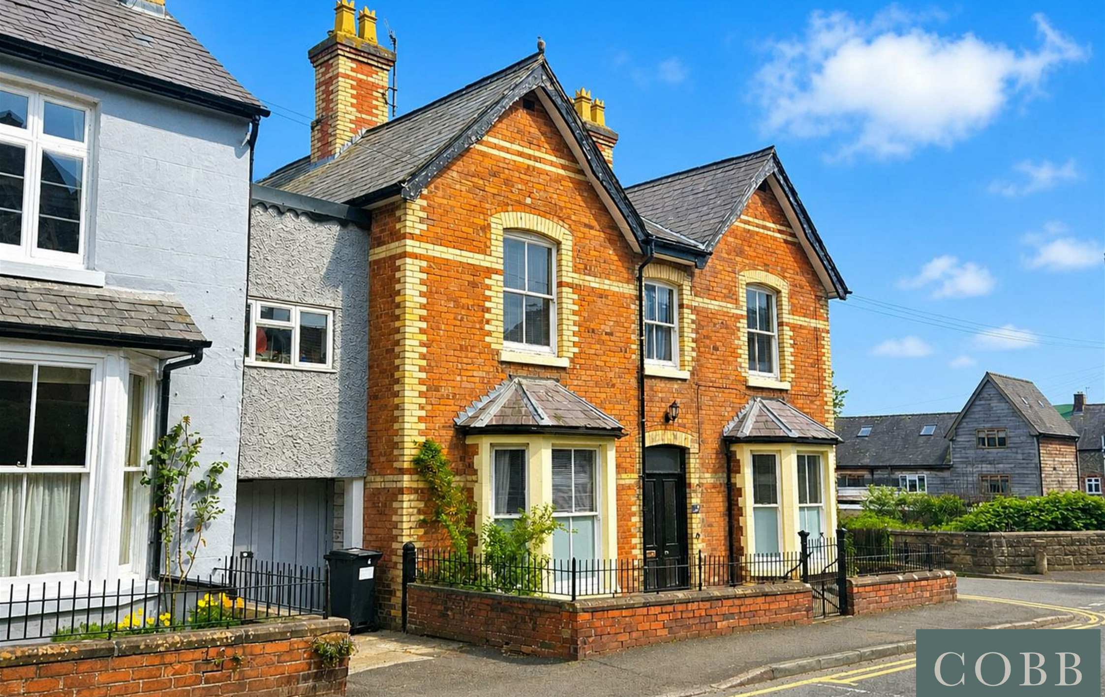
Walton House, 8, West Street, Knighton, LD7 1EN Price £375,000