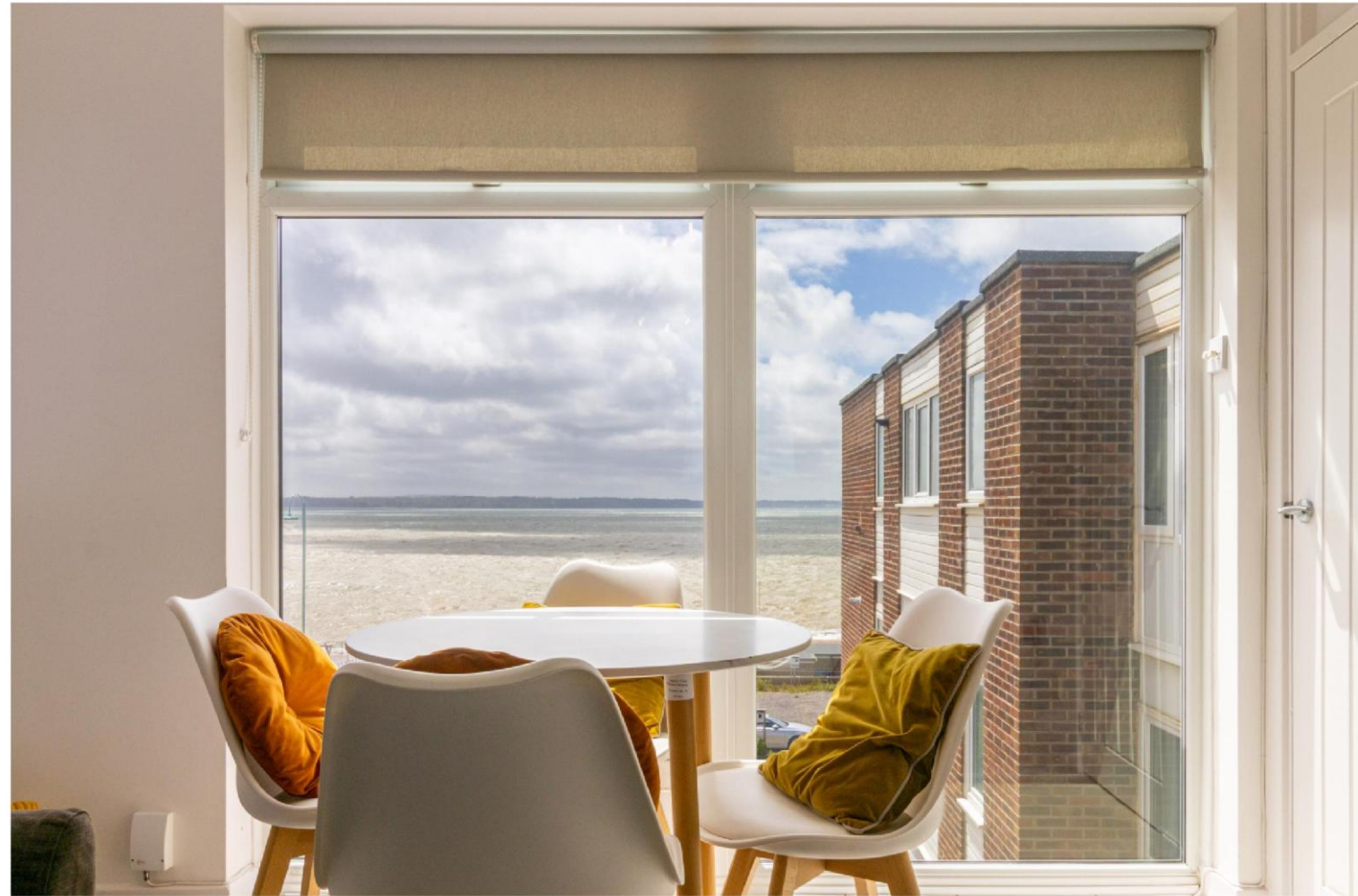
At home in Lee-on-the-Solent