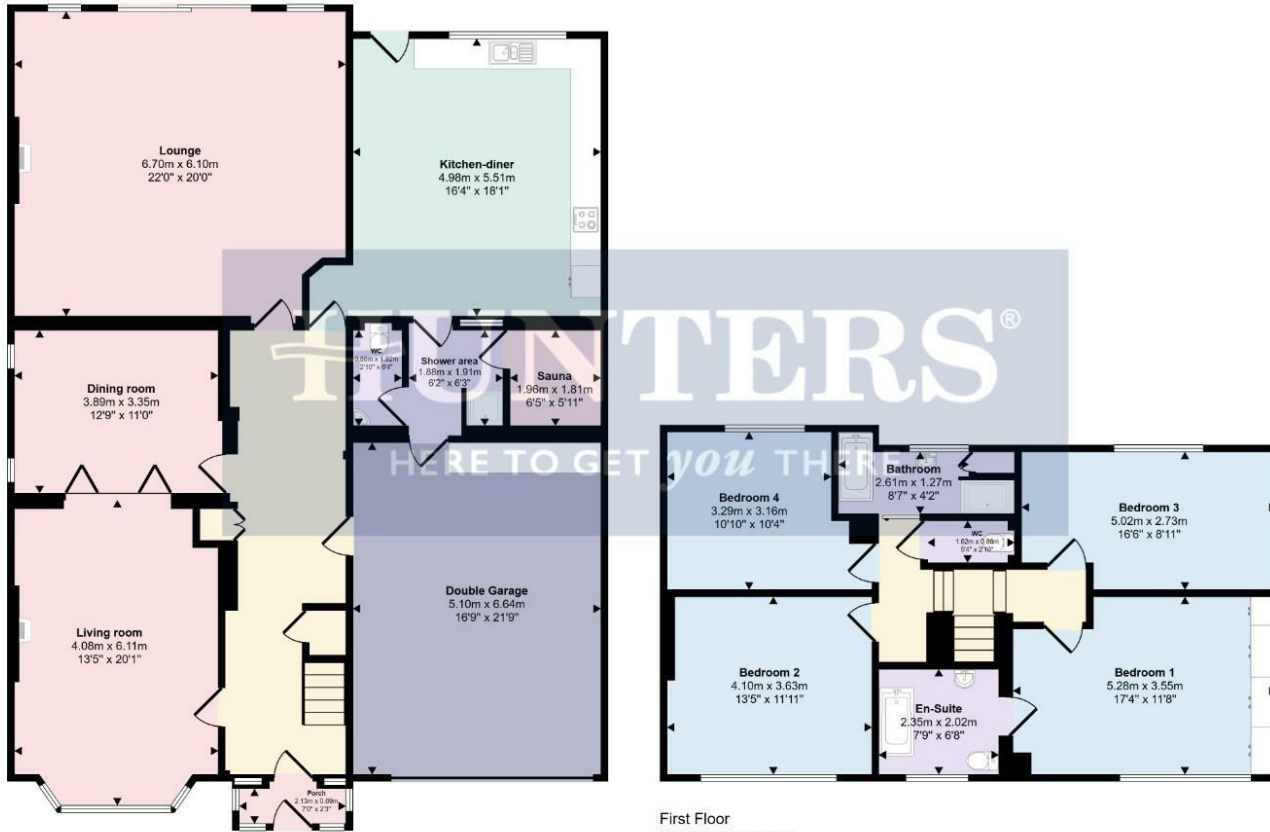
Ground Floor Approx 182 sq m / 1959 sq ft

Approx Gross Internal Area 282 sq m / 2825 sq ft