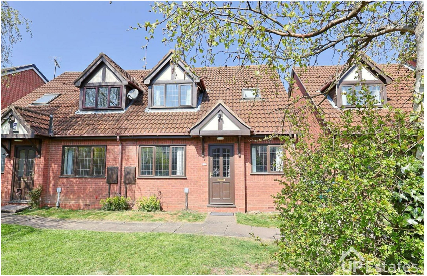
Sandpiper Road, Coventry