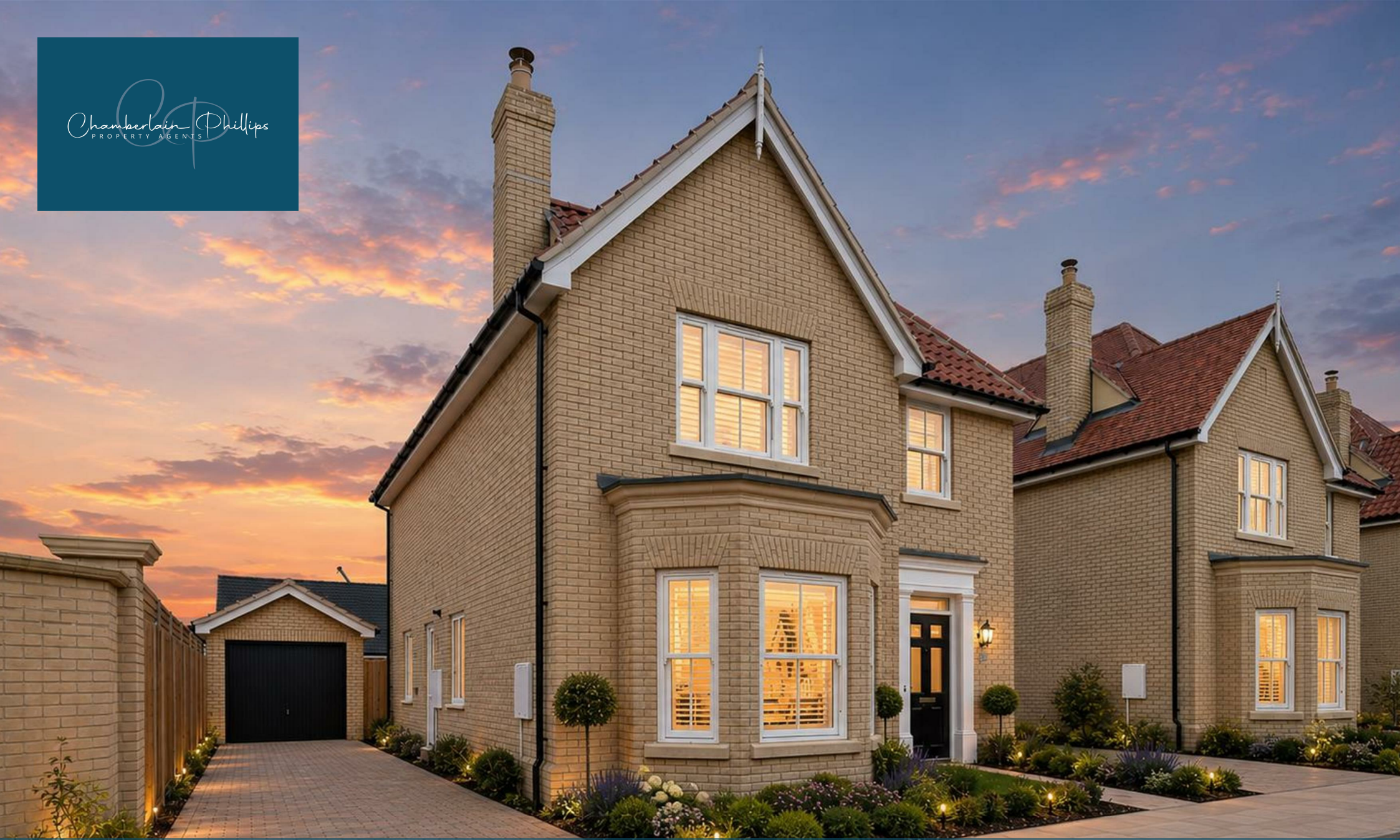
The Victoria, The Avenue, Manningtree £550,000