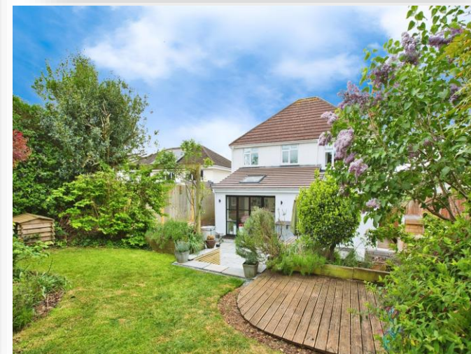
96 Wookey Hole Road, Wells, BA5 2NQ