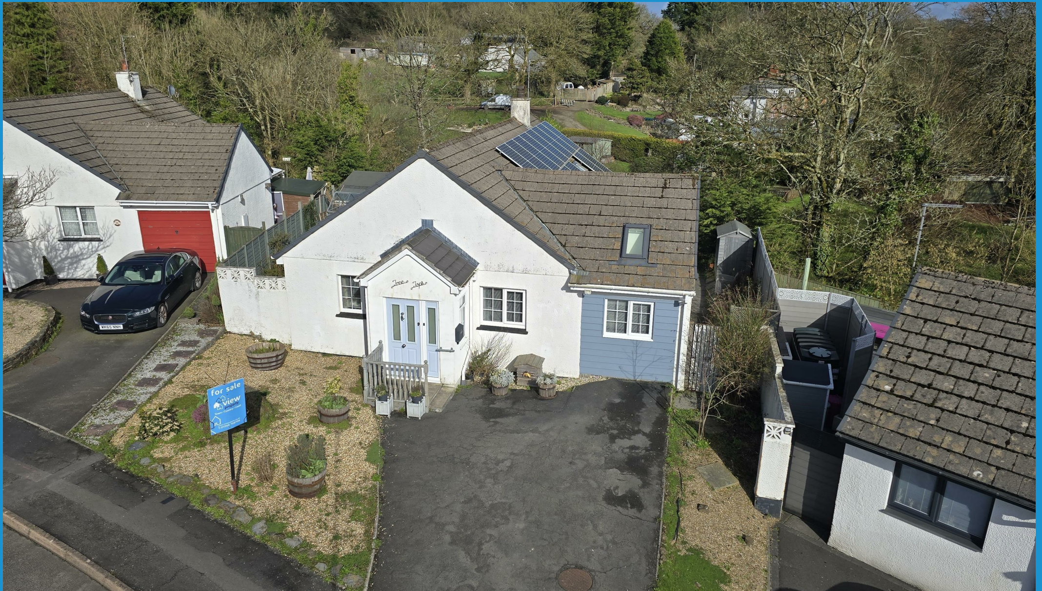
Coles Mill Close Holsworthy | Devon