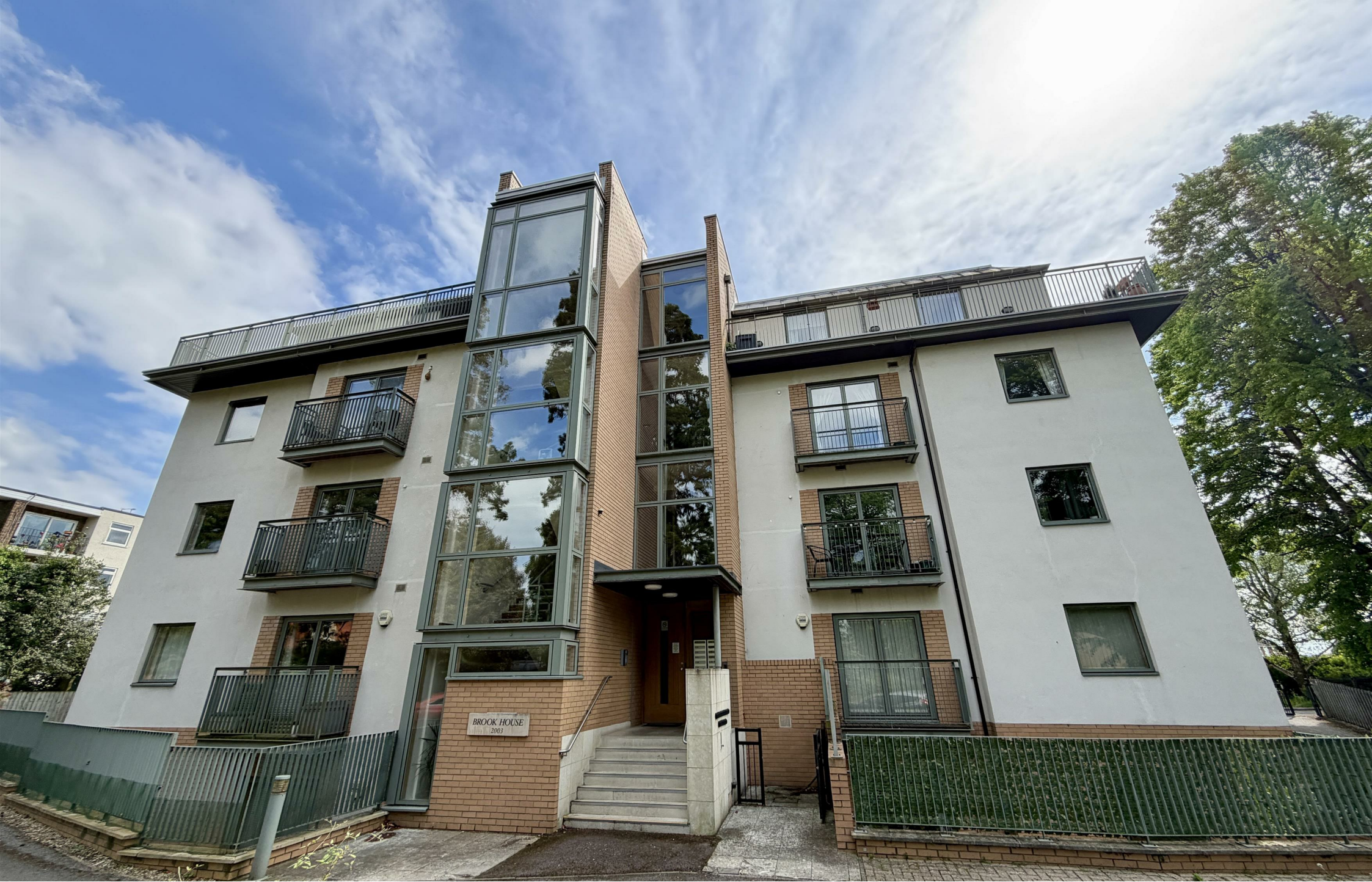
19 BROOK HOUSE, BELWORTH DRIVE, CHELTENHAM, GL51 6EZ