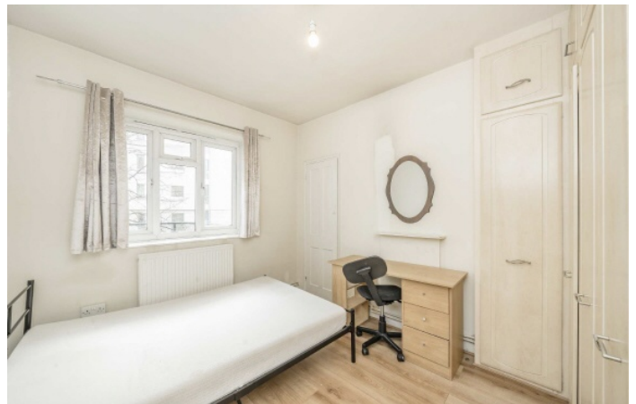
Long Lane, SE1