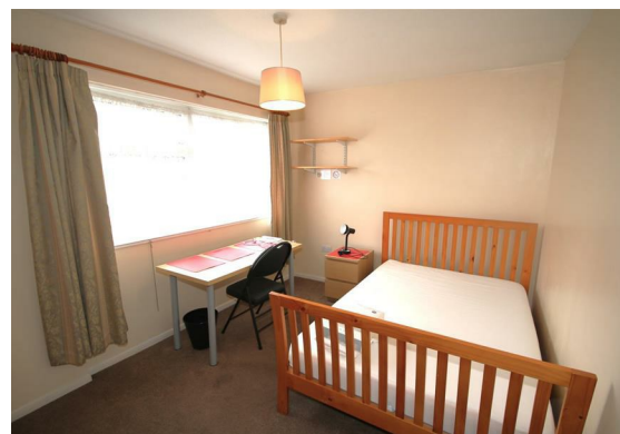
Bedroom 4 11'0" x 12'1" (3.363 x 3.688)