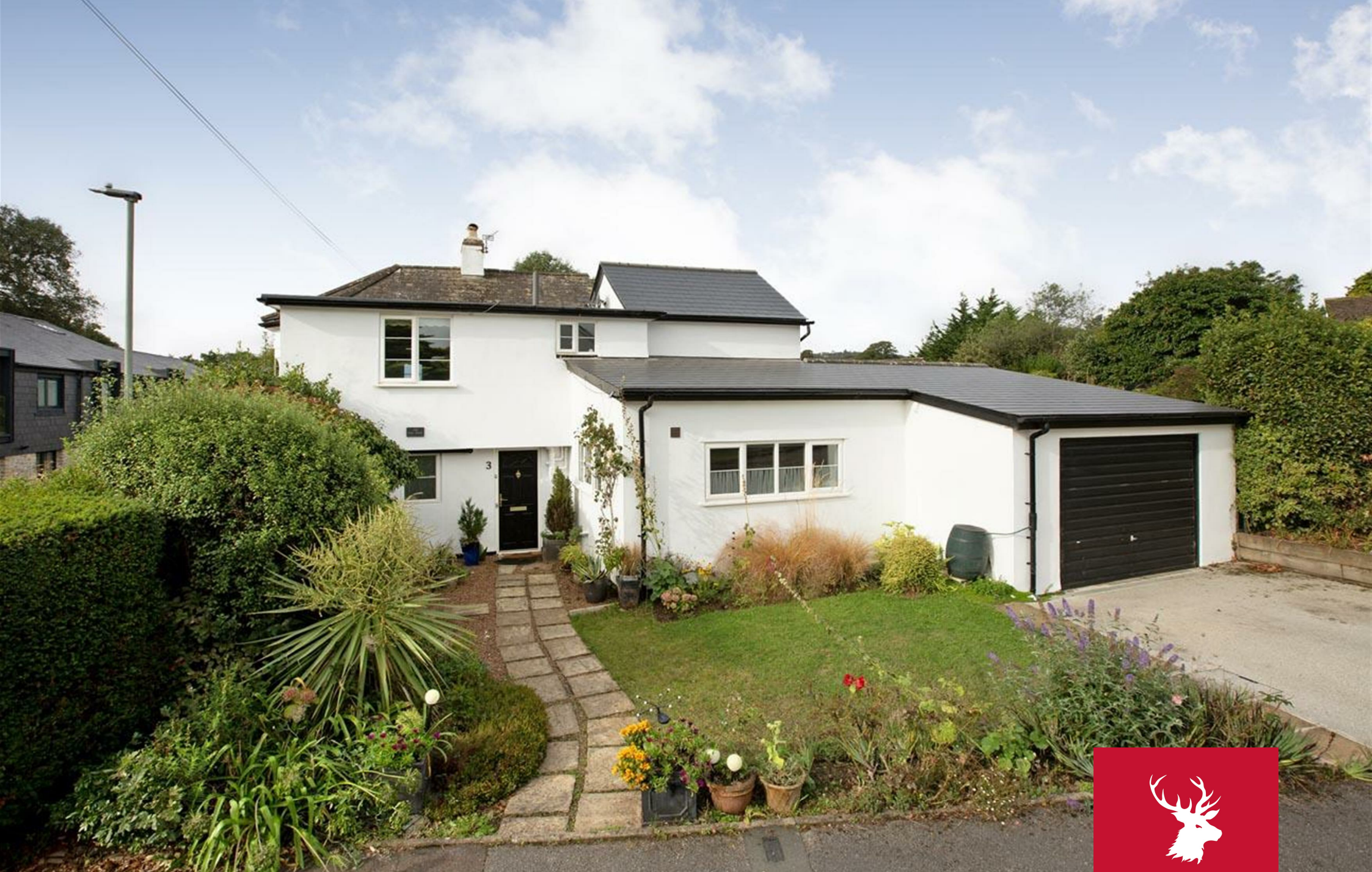
The Toll House