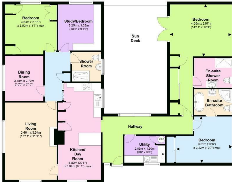
Total area: approx. 135.2 sq. metres (1455.4 sq. feet)

Whilst every attempt has been made to ensure the accuracy of this floor-plan, measurements are approximate and no responsibility is taken for any error or omission. The plan is for representation purposes only and should be used as such by any prospective purchaser Plan produced using PlanUp.