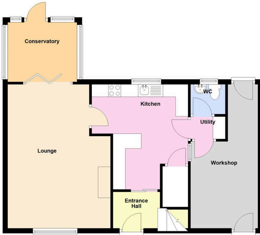
Ground Floor Approx. 70.3 sq. metres (756.6 sq. feet)