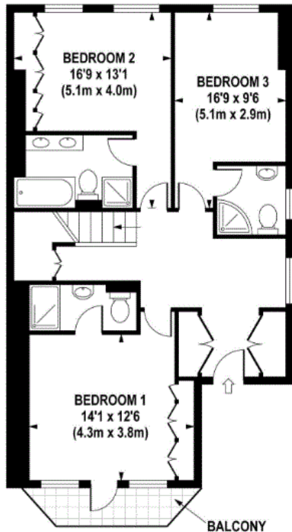
SECOND FLOOR GROSS INTERNAL FLOOR AREA 840 SQ FT