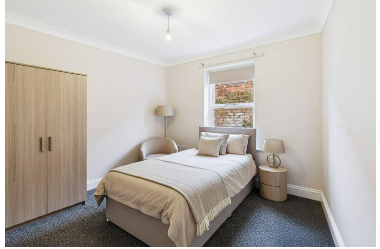
VIRTUALLY STAGED - Bedroom 2