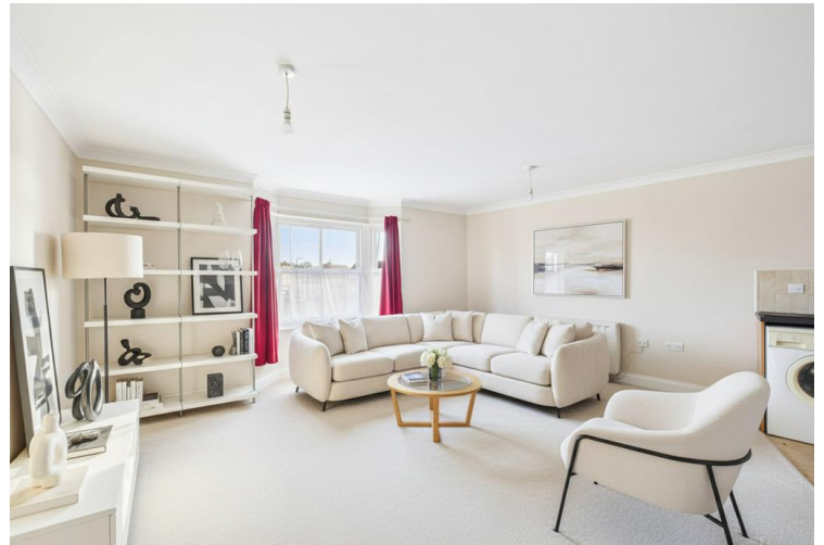
VIRTUALLY STAGED - Lounge/Kitchen