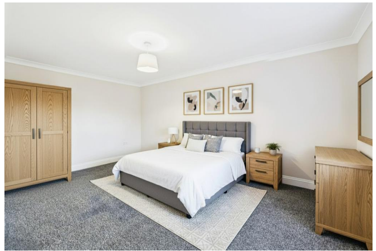
VIRTUALLY STAGED - Bedroom 1