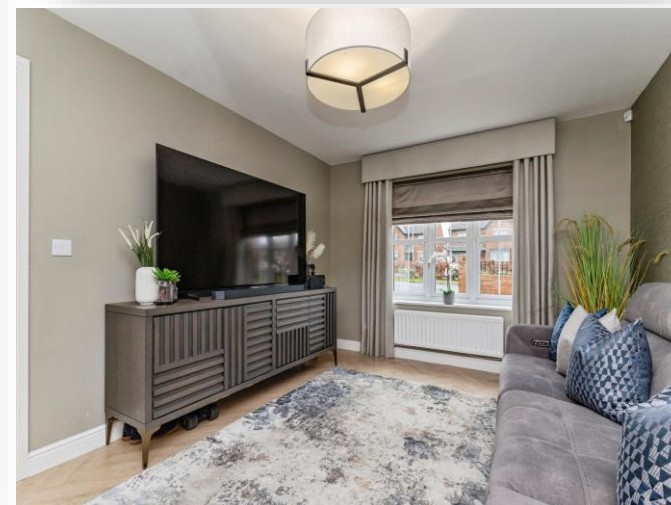
Plough Grange, Middlesbrough TS5 8FQ