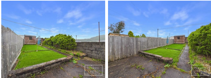
Paved forecourt. Good size, level garden with seating area, lawns and rear access.