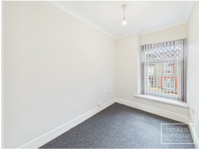
Double glazed window to front, radiator, covered ceiling.