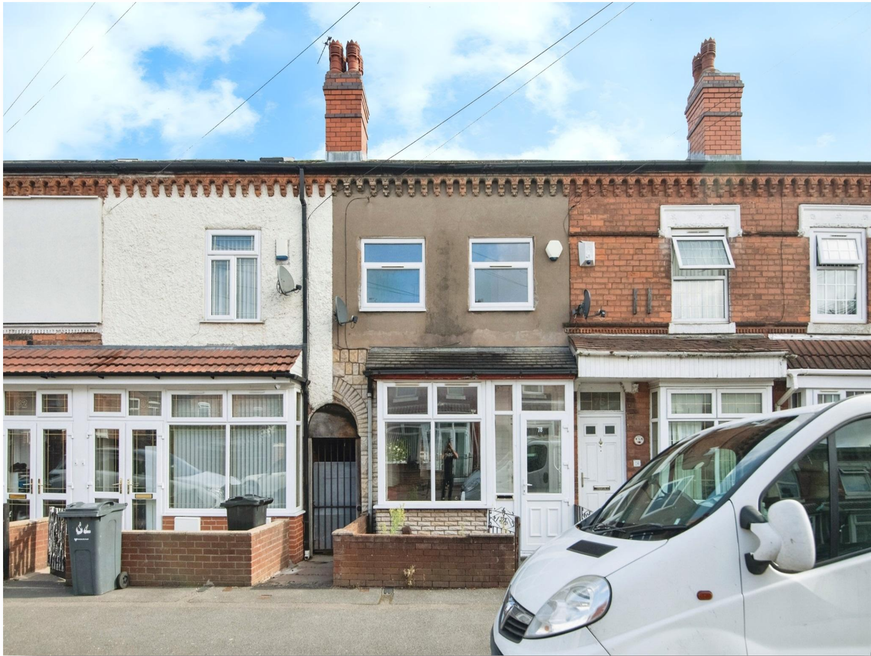
Maidstone Road, Birmingham B20 3EH