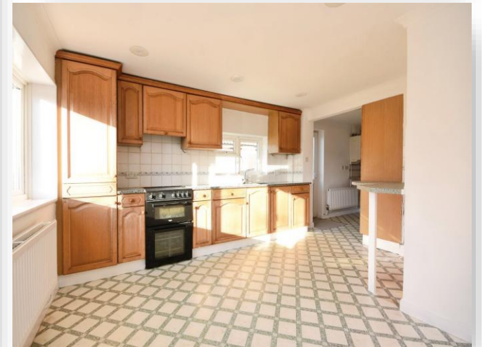
The Chase, Pretoria Road, Halstead, CO9 2EG