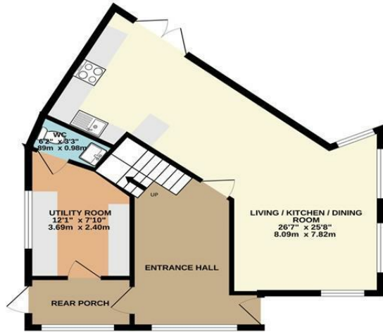
GROUND FLOOR 573 sq.ft. (53.3 sq.m.) approx.