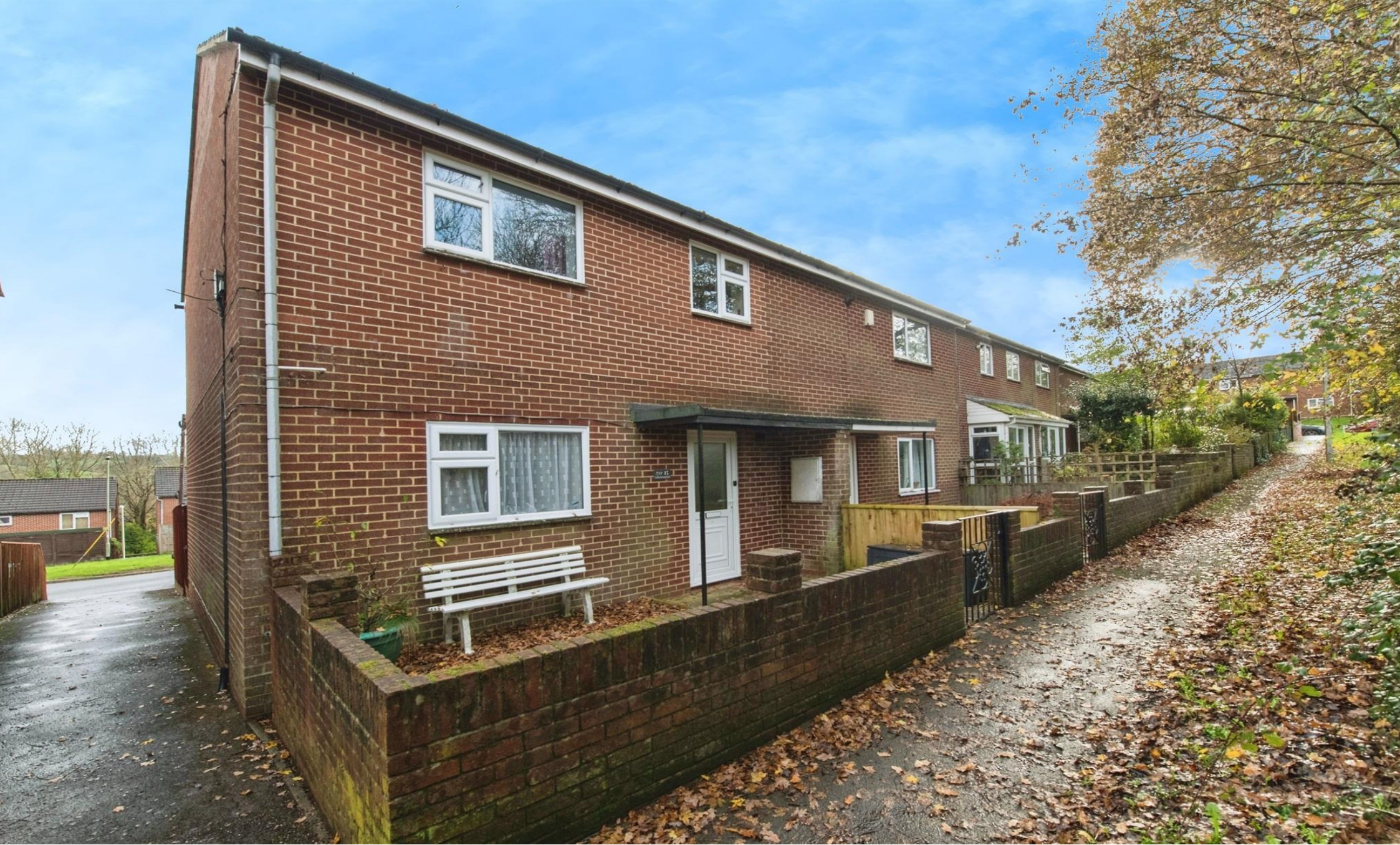
Cameron Close, Tiverton EX16 5DB