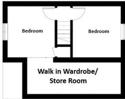
Top Floor Approx 374 square feet

This plan is for illustrational purposes only.