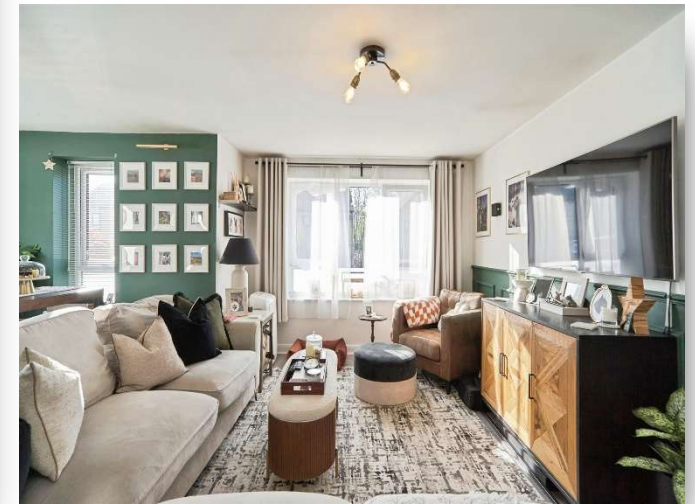
Cambridge House Beck View Way, Shipley BD18 2FF