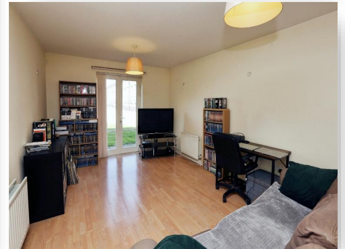
The Officers Quarters, Gosport PO12 1AG