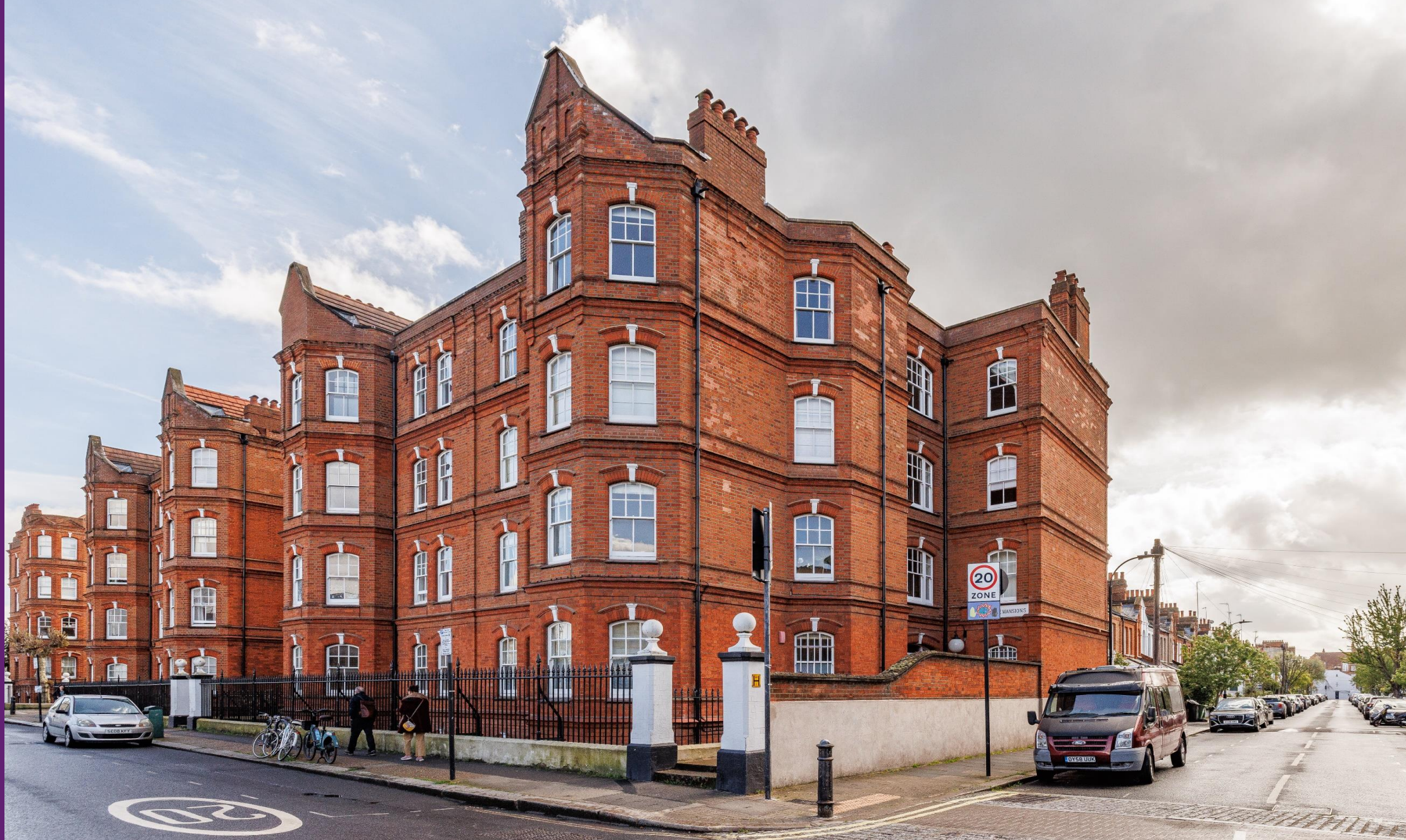
Melbourne Mansions Queens Club, W14