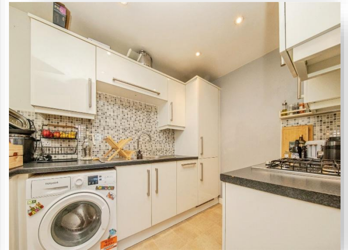
Beche House, Circular Road South, Colchester, CO2 7UE