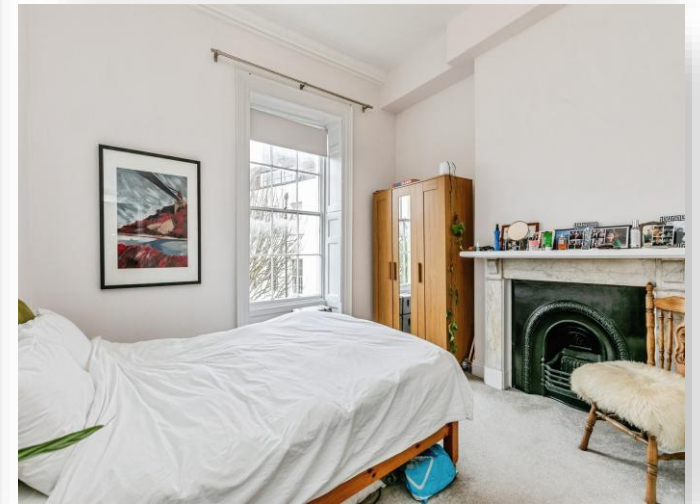
First Floor Flat Richmond Terrace, Clifton Bristol BS8 1AA