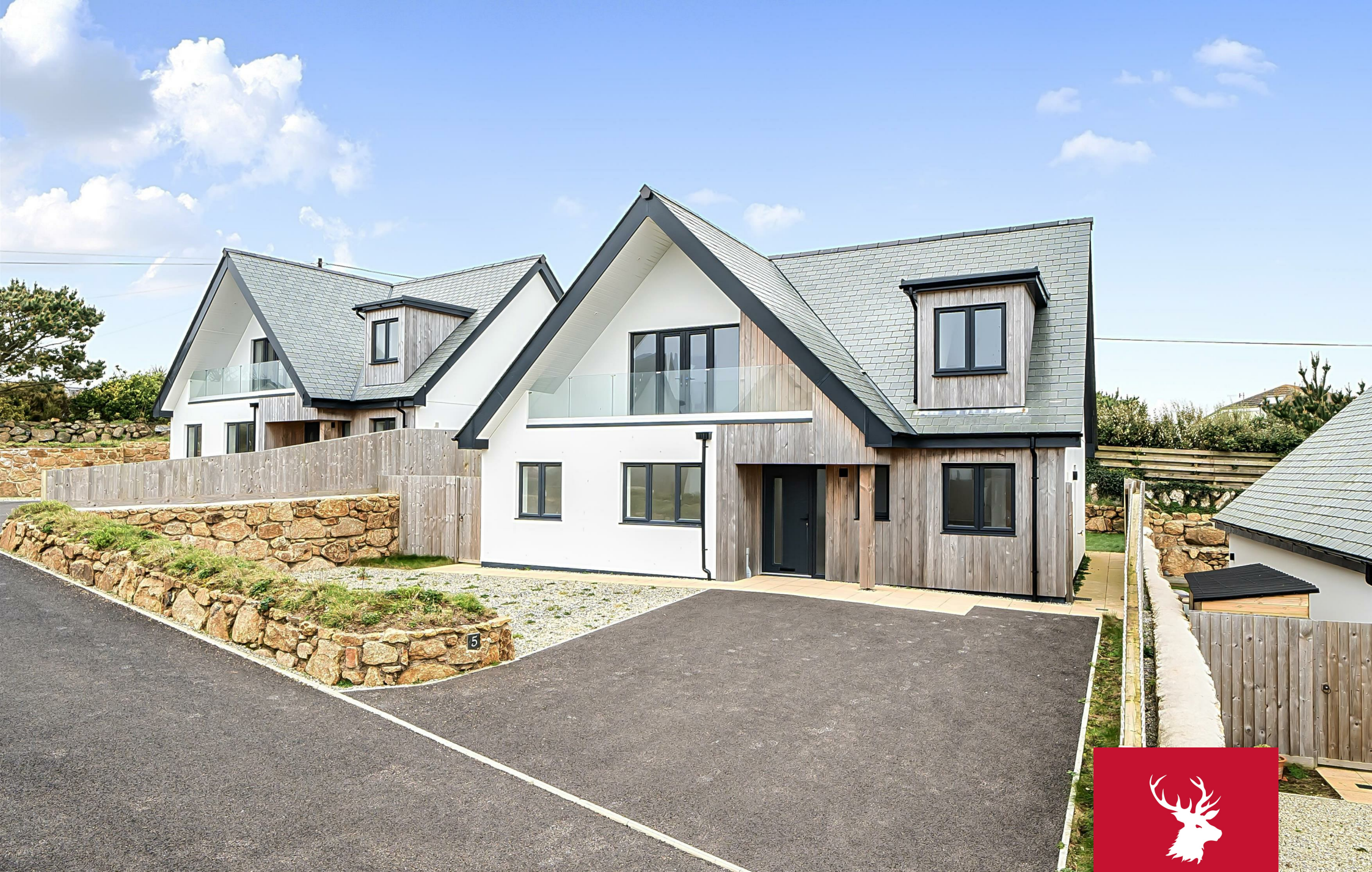
5 Atlantic Watch