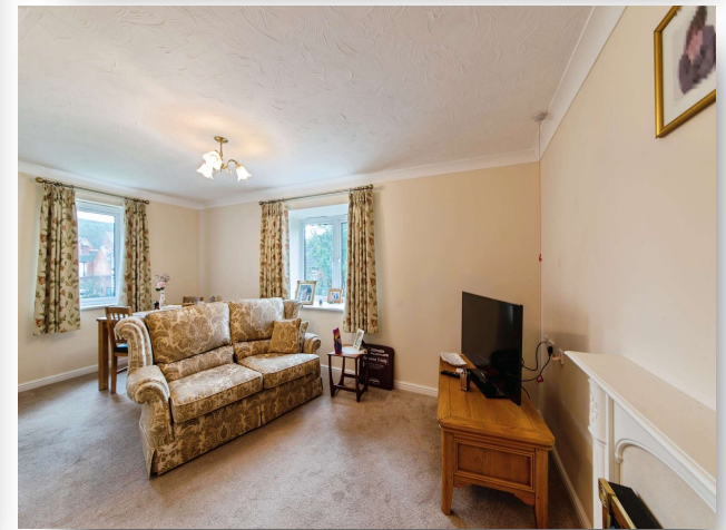
Moores Court Jermyn Street, Sleaford NG34 7UL