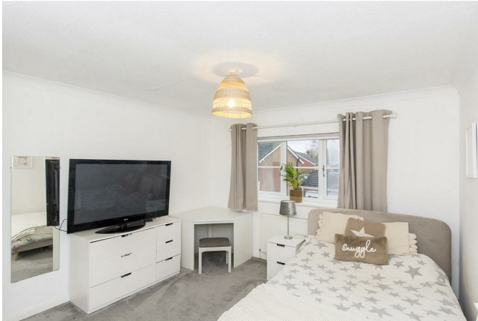
UPVC double-glazed window to front. Built in wardrobe. Radiator.