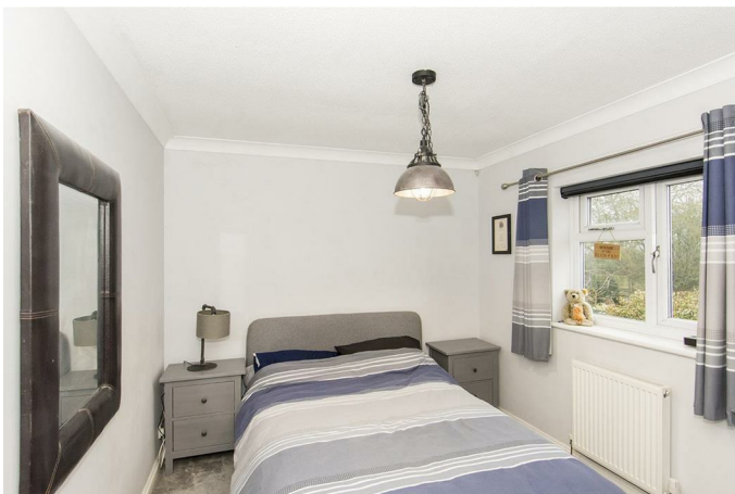
UPVC double-glazed window to rear. Radiator.