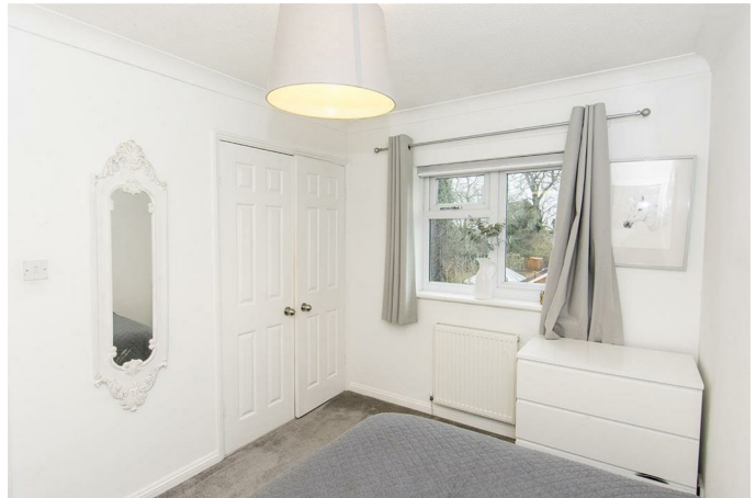
UPVC double-glazed window to rear. Built in wardrobe. Radiator.