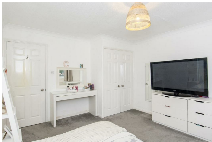
Bedroom Three 11'2" x 9'1" (3.40m x 2.77m)