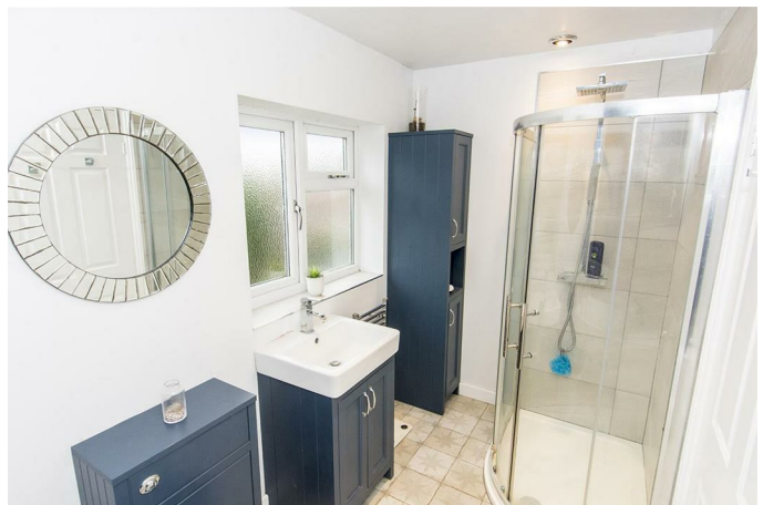
UPVC double-glazed window to rear. White four piece suite comprising WC, wash hand basin over storage unit, shower cubicle and panelled bath. Spotlights to ceiling. Heated towel rail.