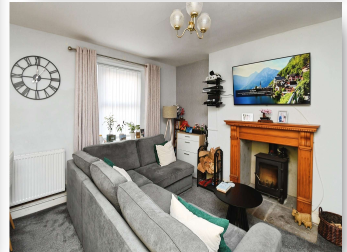
Holme Lane, Ruskington Sleaford NG34 9DN