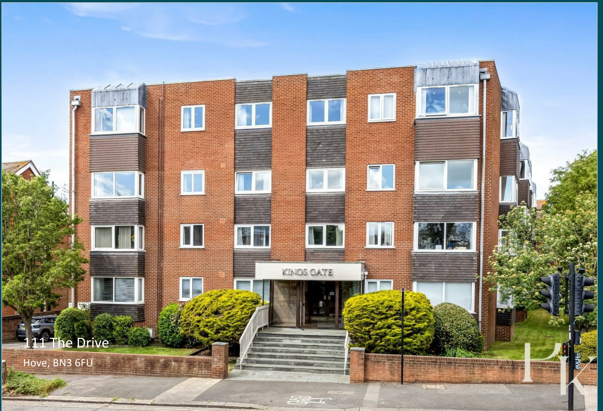
111 The Drive Hove, BN3 6FU