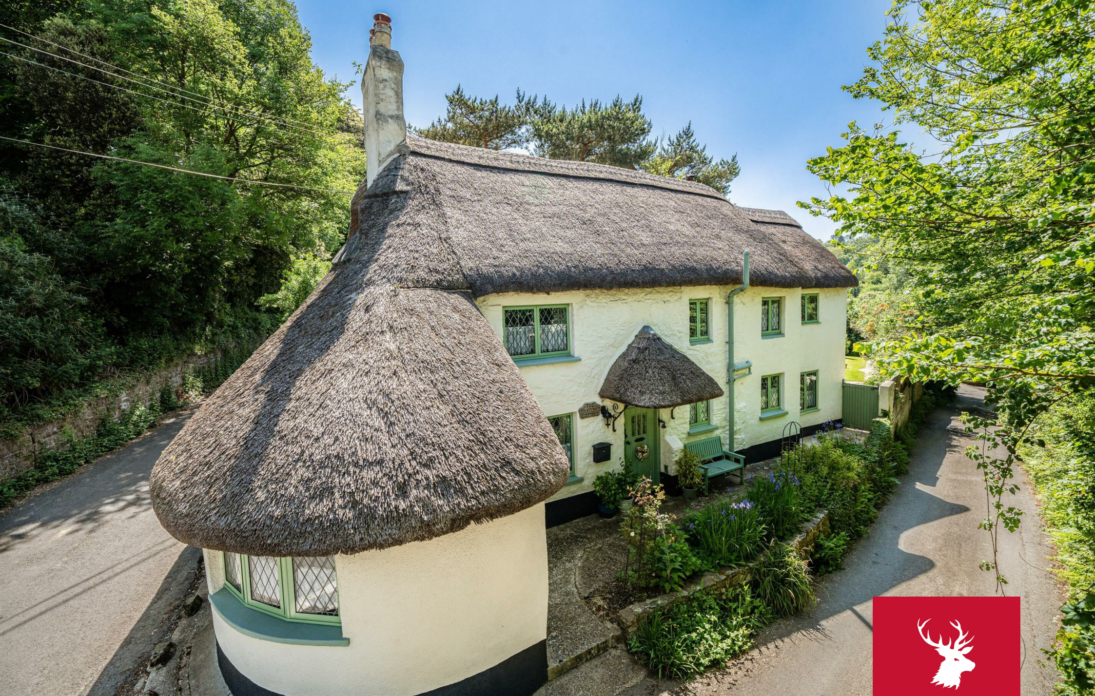
The Thatched Cottage