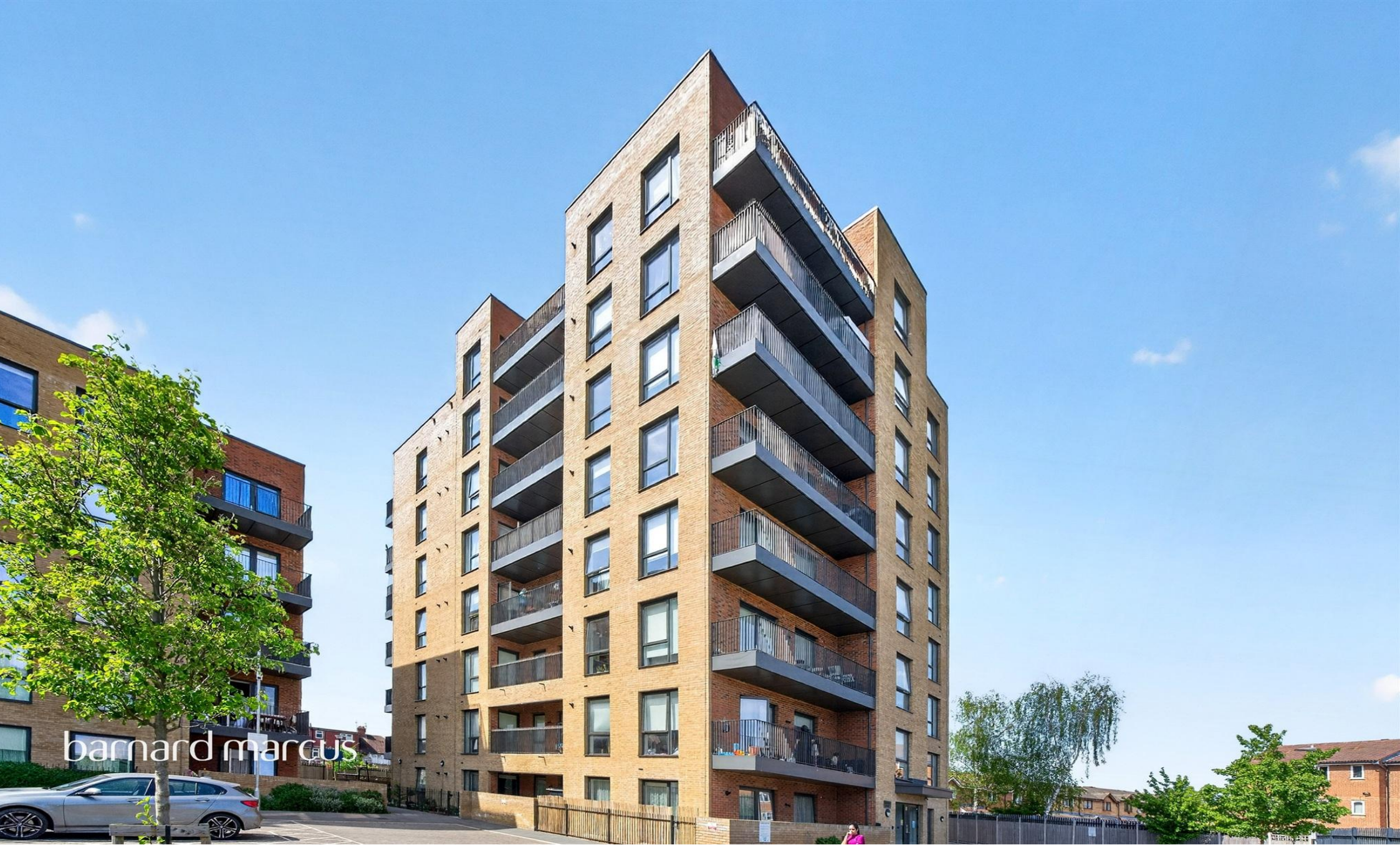
Botany Court, Parva Grove, Greenford