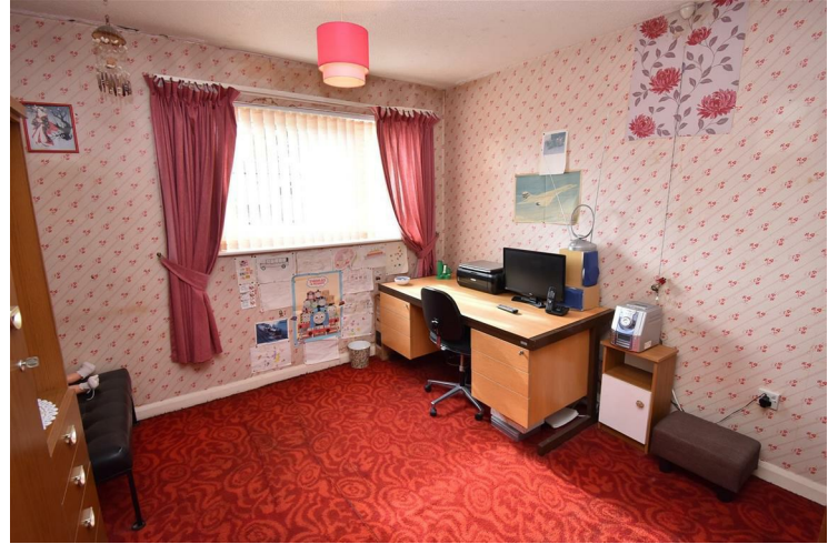
Second double bedroom with a double glazed rear window.