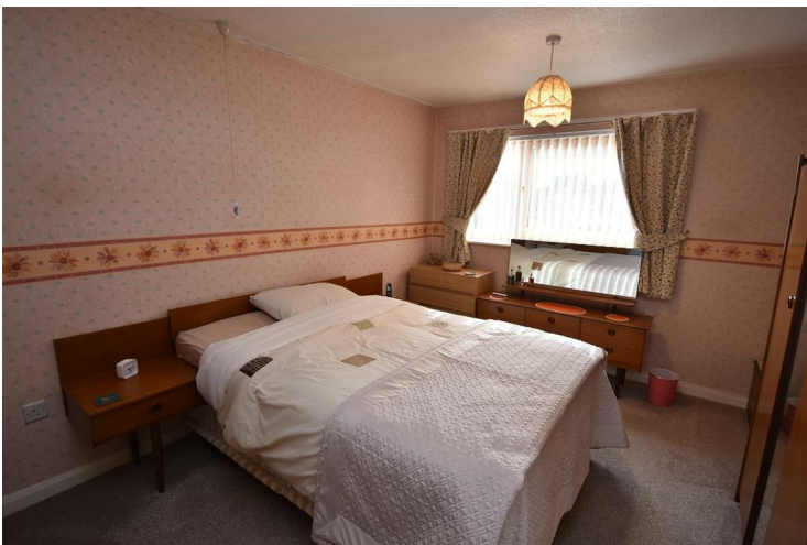
Generous main bedroom with a double glazed rear