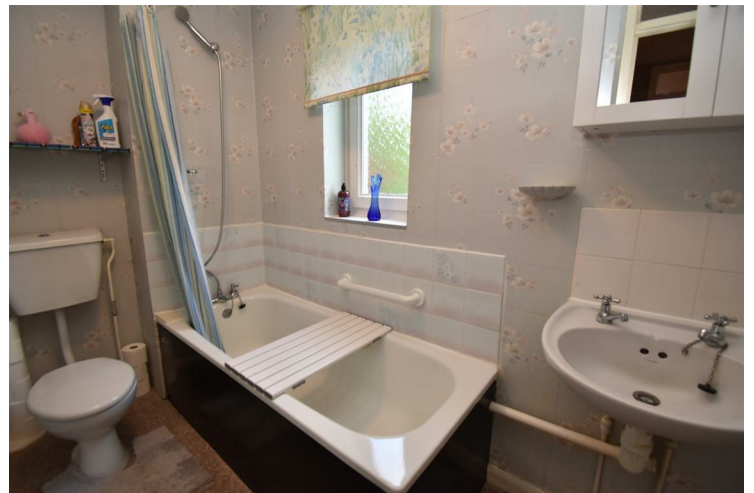
Three piece suite comprising bath with a shower