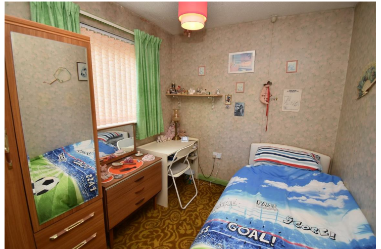
Single third bedroom with a double glazed front window.