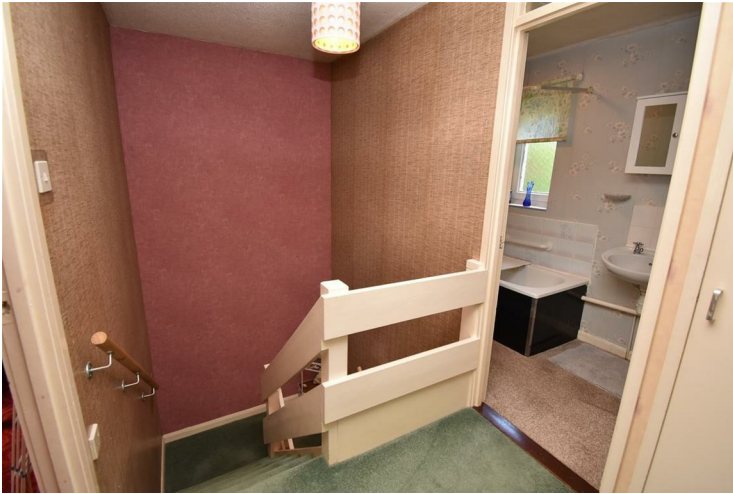
Access to the loft space, built airing cupboard with the hot water cylinder; a separate storage cupboard and doors leading off.