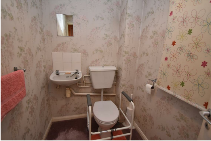
Two piece suite comprising WC and wash hand basin, with a double glazed front window.