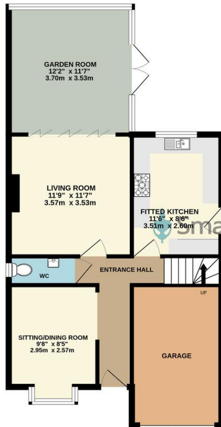
GROUND FLOOR 661 sq.ft. (61.4 sq.m.) approx.