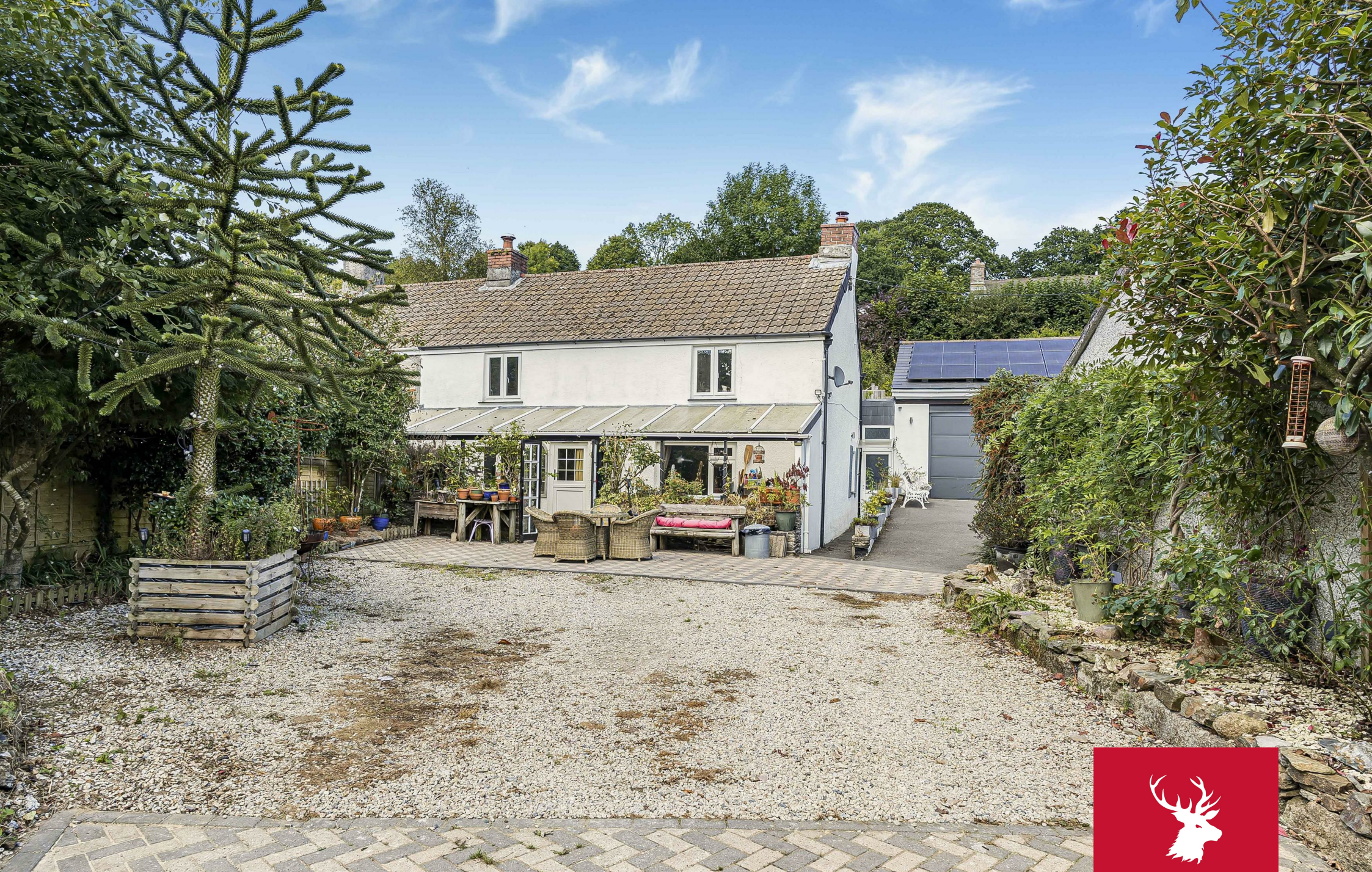
Fir Tree Cottage