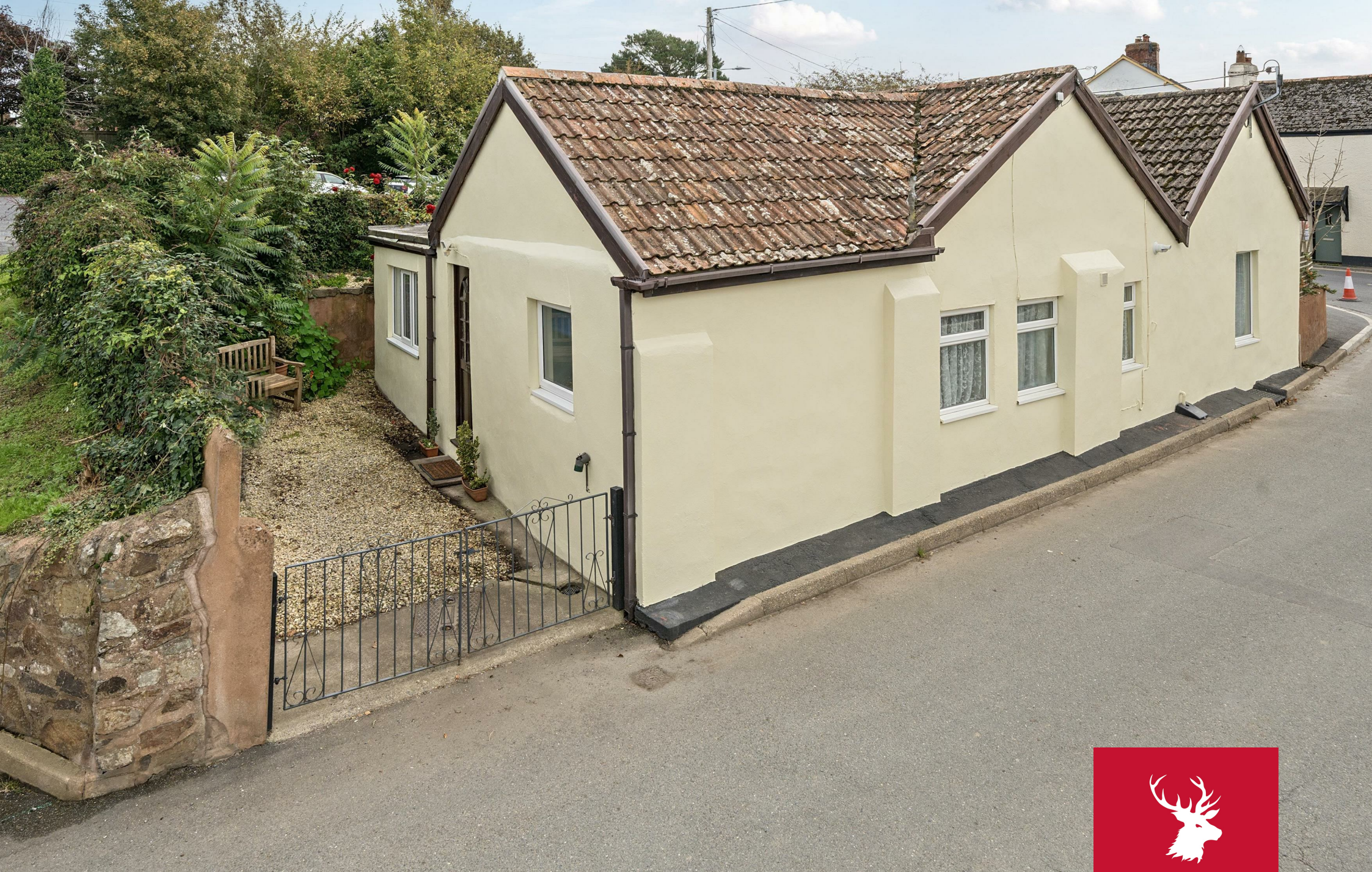
Miniville, North Lane