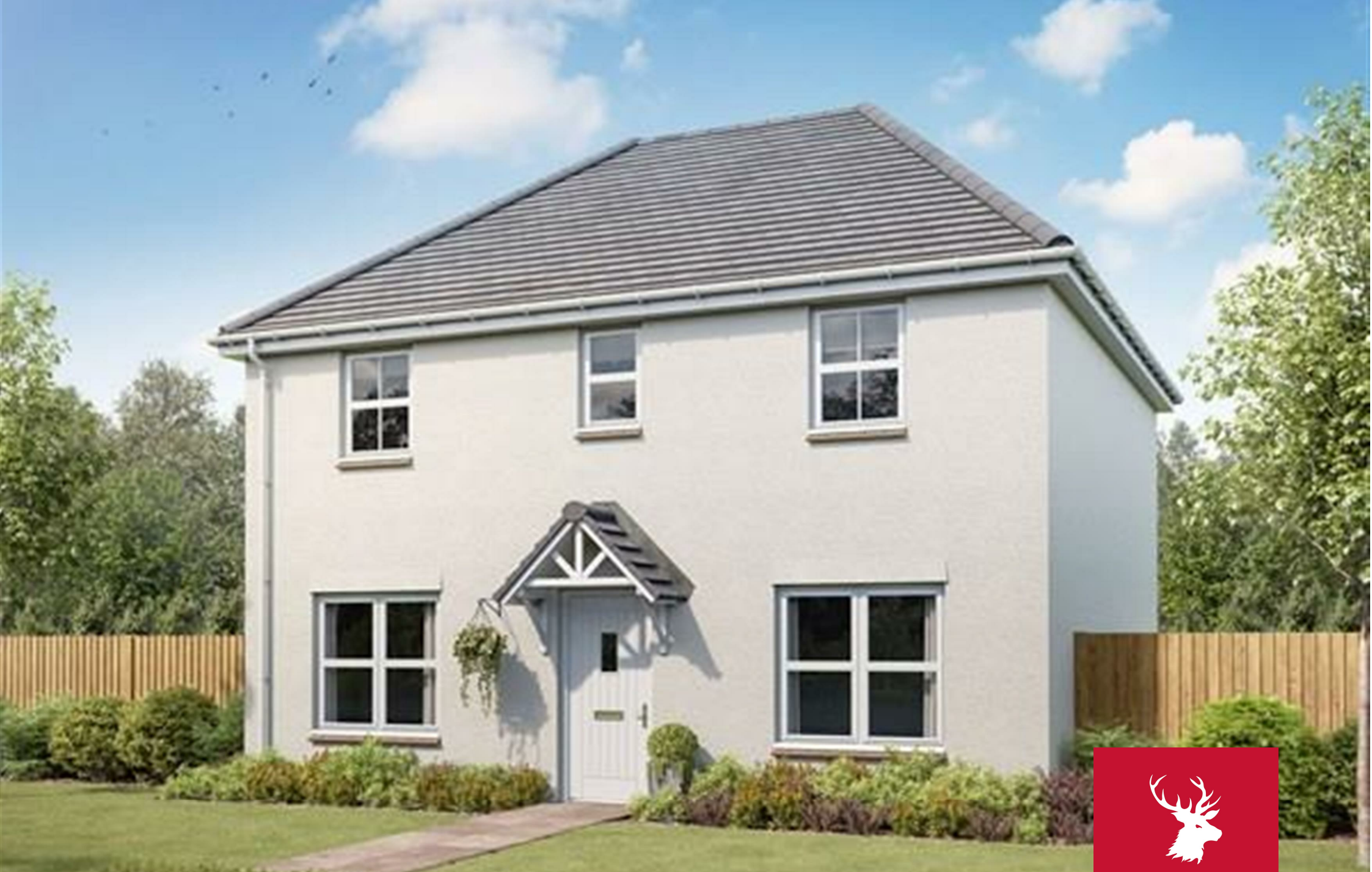
The Brampton, plot 36