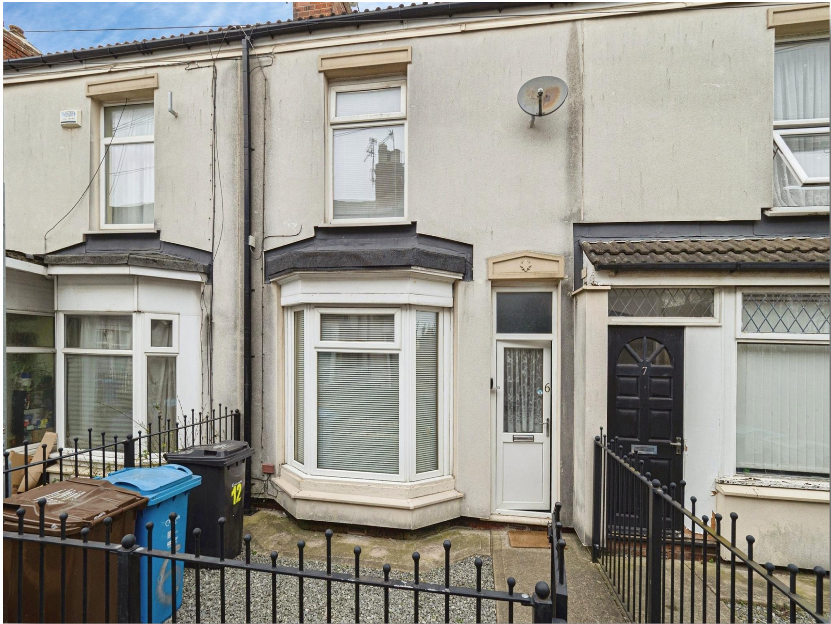
Ernests Avenue, Hull, HU9 2JP