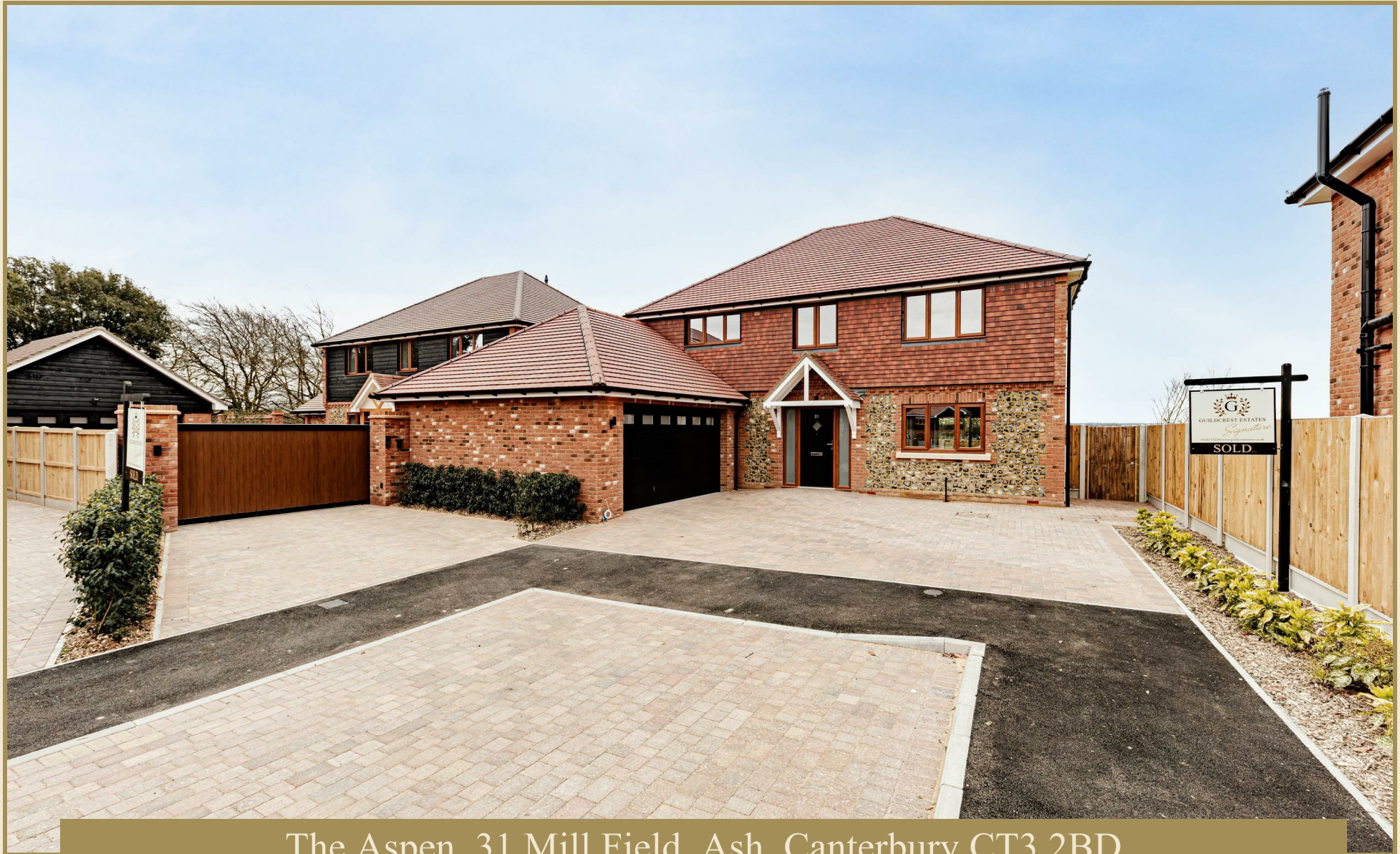
The Aspen, 31 Mill Field, Ash, Canterbury CT3 2BD