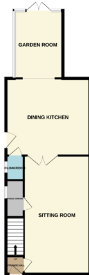
GROUND FLOOR 742 sqft (69.0 sqm.) approx.