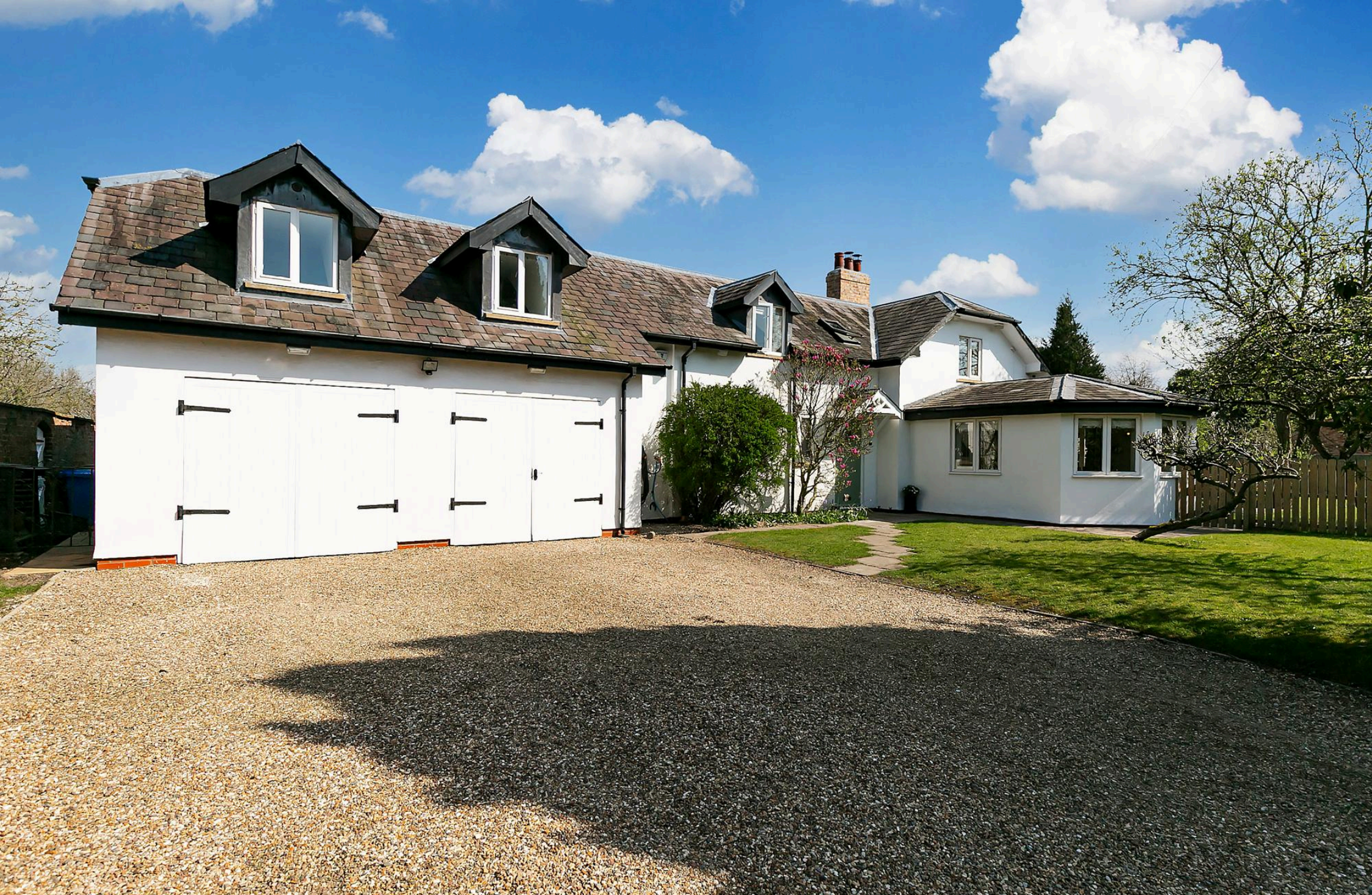
A STUNNING FAMILY HOME LOCATED IN THE HEART OF EVERINGHAM