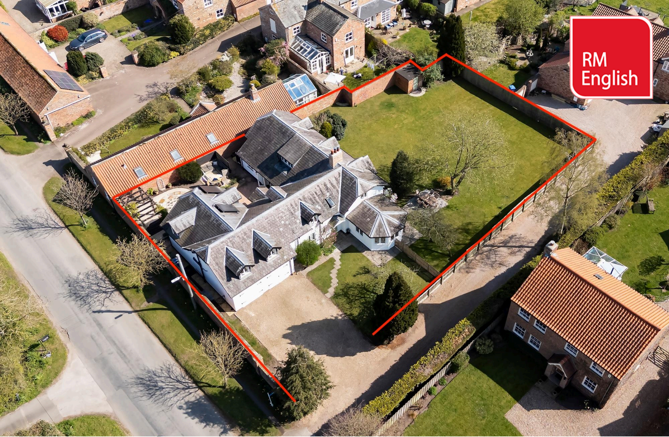
Home Farm Cottage, Everingham, York, YO42 4JD