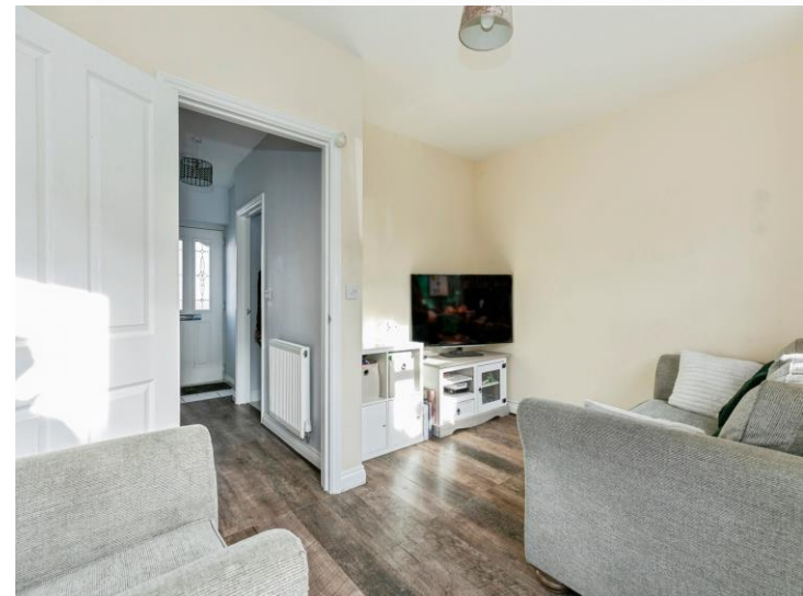
Whyte Terrace, Ramsey Huntingdon PE26 1GT