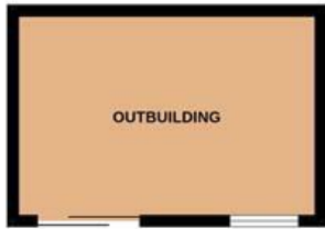
GROUND FLOOR 875 sq.ft. (81.3 sq.m.) approx.